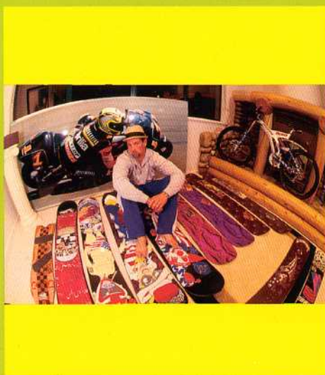
Icon Shaun Palmer and his quiver . Meeks Bay, Tahoe, 1998, Lightjet print from original transparency, 20x30"