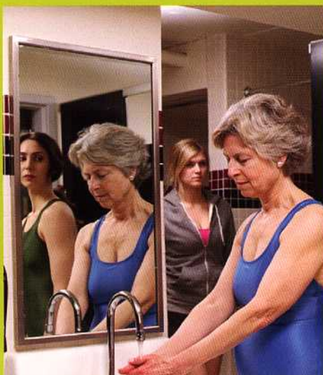
Untitled, (Bathroom) , 2007, Archival ink on paper, 30x40"